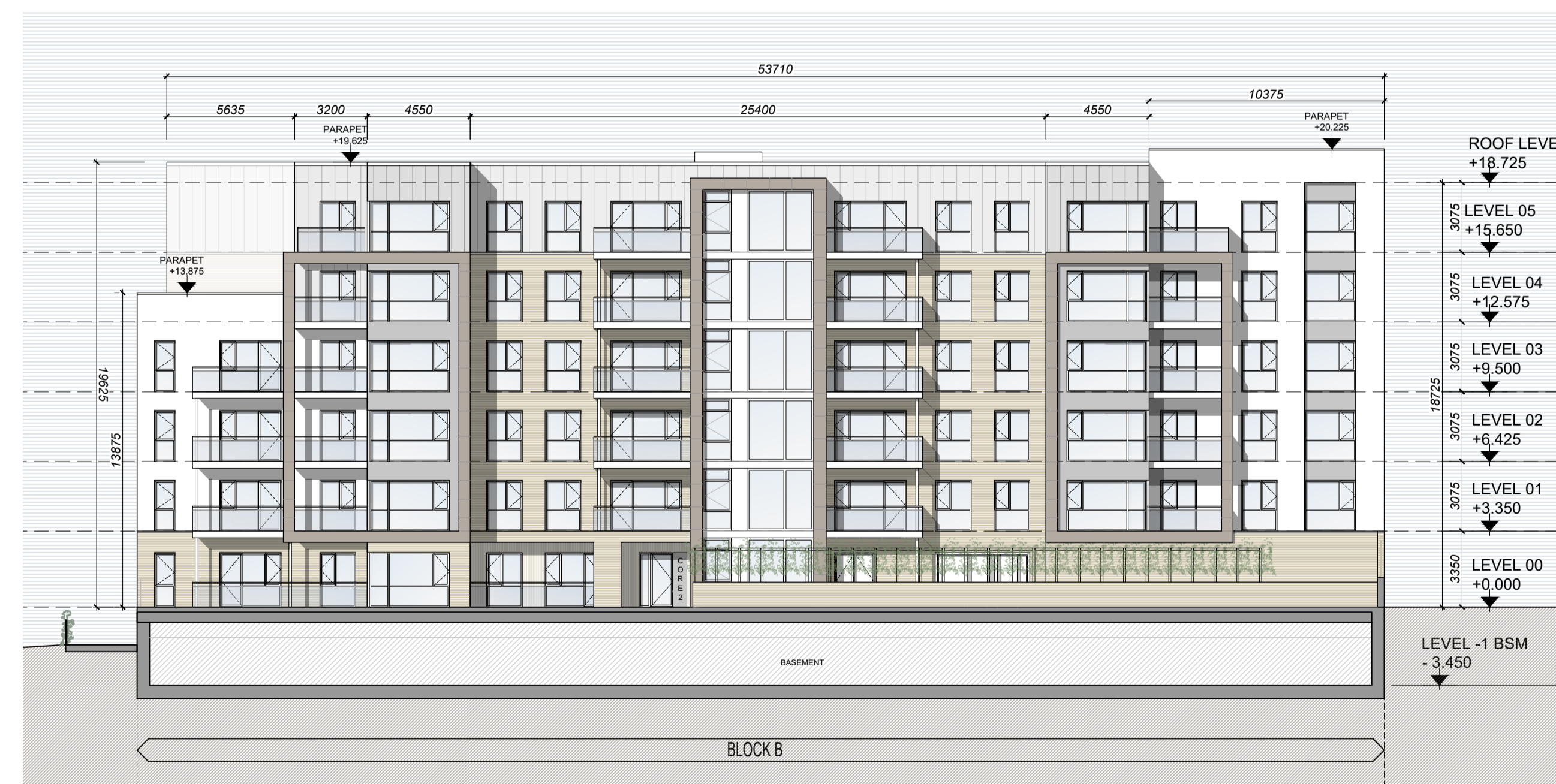
BLOCK B - WEST ELEVATION - 06