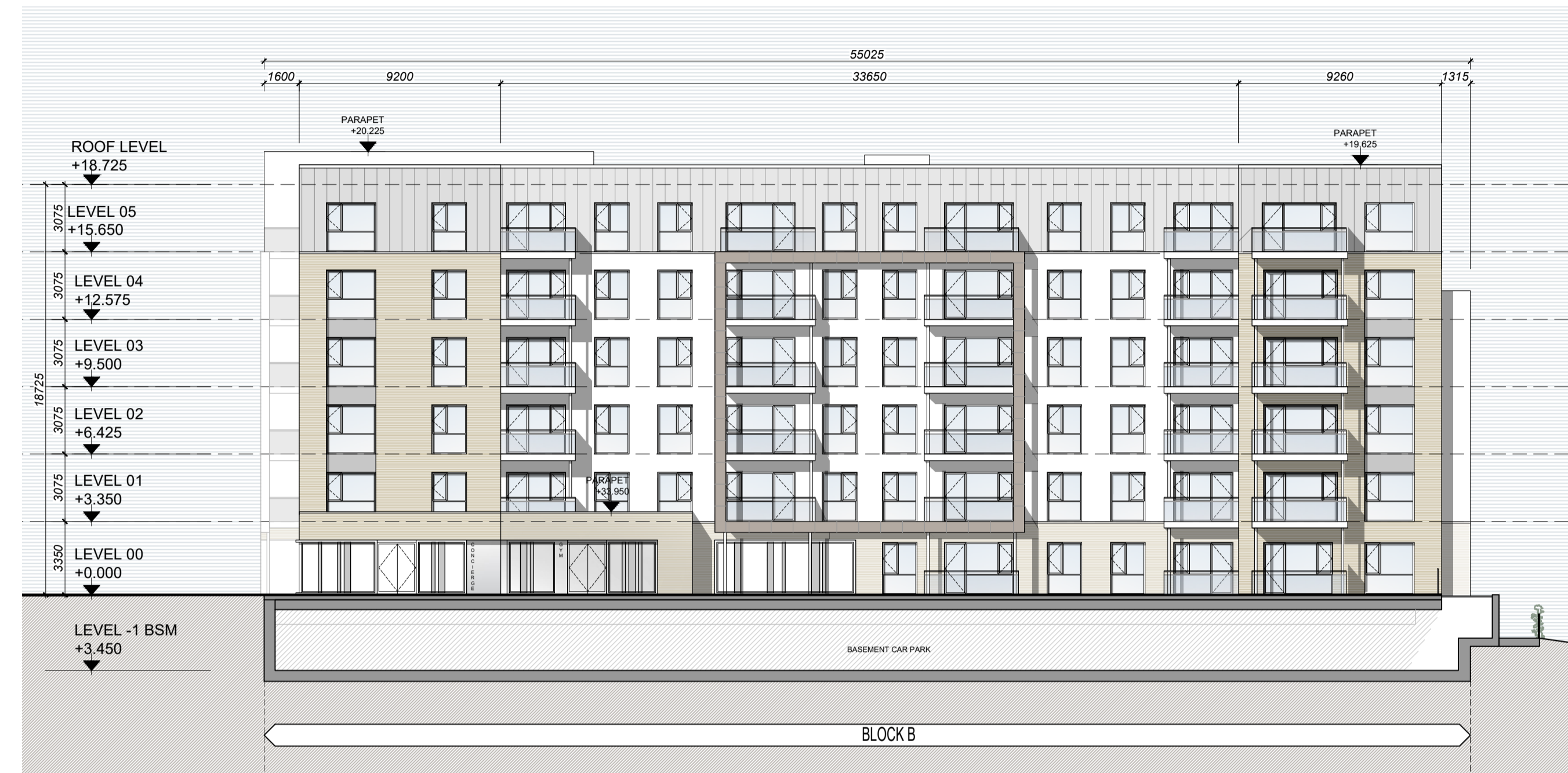
BLOCK B - EAST ELEVATION - 07