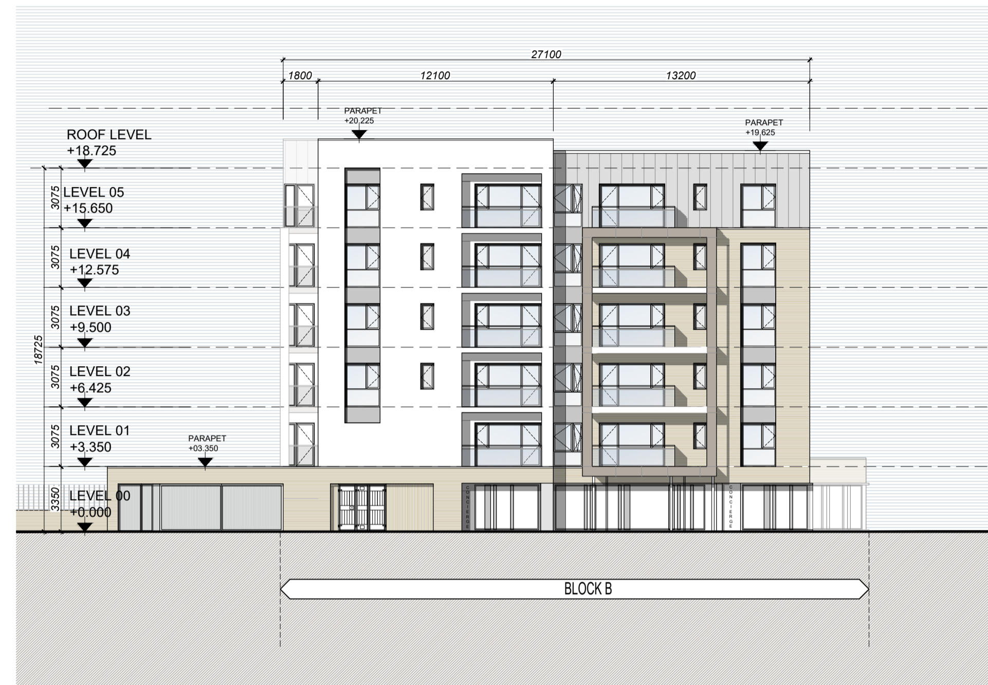
BLOCK B - SOUTH ELEVATION - 01