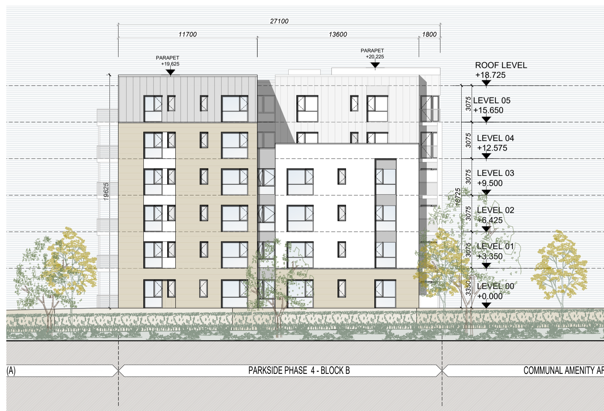
BLOCK B - NORTH ELEVATION - 02